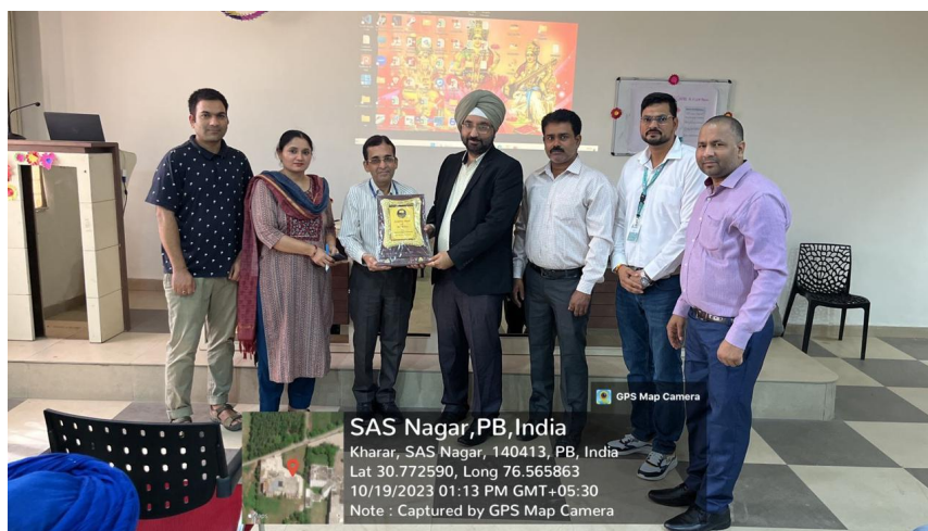
Presenting the honorable mark to the Marg team