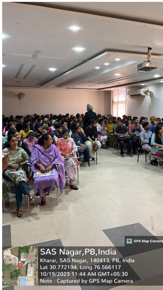
Students attending the seminar