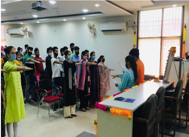
Faculty & Students taking Pharmacist's Oath